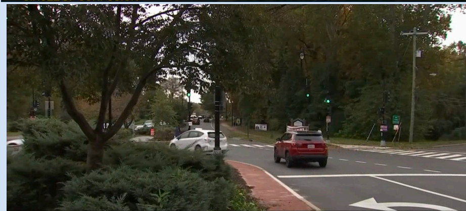
CIRCLE OF CONFUSION

Twitter Facebook Instagram @NBCWASHINGTON