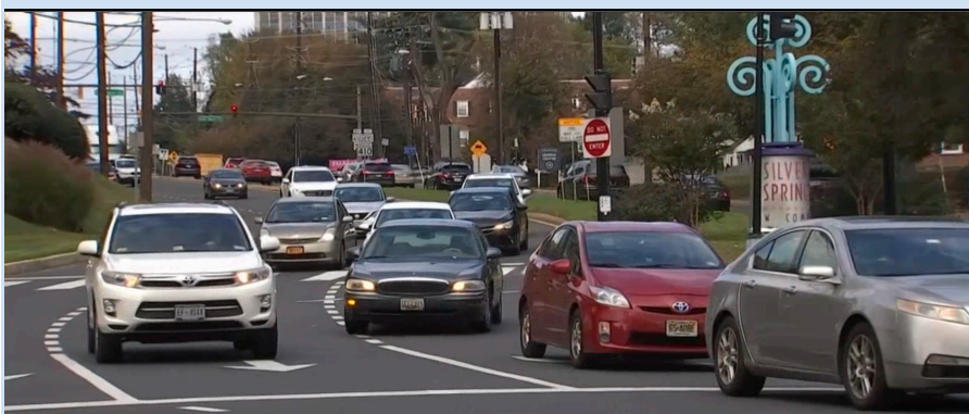
CIRCLE OF CONFUSION